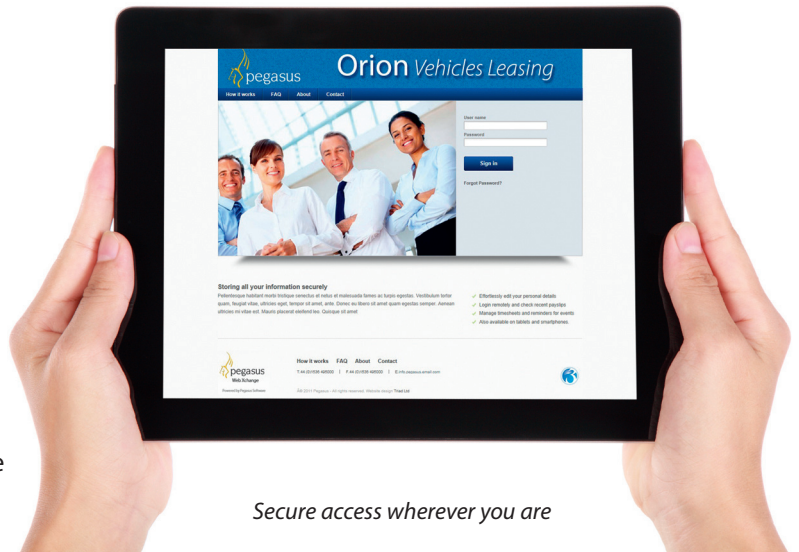
Secure access wherever you are