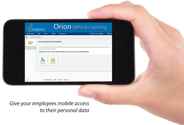
Give your employees mobile access to their personal data

Online payslips are available for the employee to access as soon as the payroll team release them. Employees can view current and previous payslips and print as required, eliminating postage and print costs and saving time. Printed payslips can still be produced for employees that don't use Payroll Self Service.